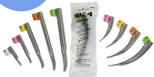
Available in Macintosh and Miller sizes