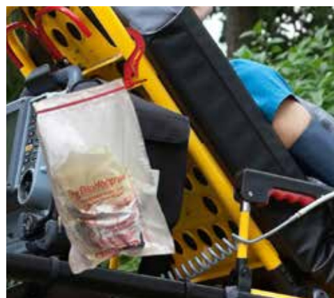
Easily and safely manage scene garbage or patient belongings quickly and efficiently.