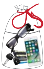
Patient Belongings & Evidence