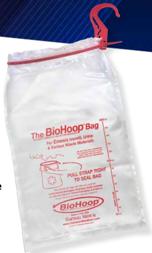
BioHoop with Hook Part Number BH 1100H BioHoop without Hook Part Number BH 1100

Clear front with graduated markings makes it easy for hospital personnel to examine contents. Tamper resistant bag is perfect for emesis, urine, blood spills, soiled dressing, patient belongings like jewelry and cell phones, evidence or other waste material.