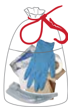
Dressings & Scene Garbage