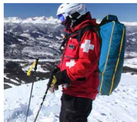
Optional backpack carry case available

The EVAC-U-SPLINT mattresses has six large padded handles secured to the perimeter of the mattress which provide improved security when moving and transferring a patient and also allows for rescuers to share handles when handing off a patient in tight quarters. The EVAC-U-SPLINT is filled with thousands of polystyrene beads which act as a thermal insulator to help maintain the patient's core body temperature decreasing the potential for hypothermia.