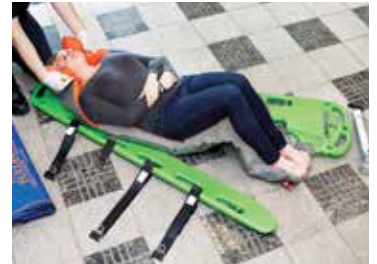
Can Be Easily Separated At Either End