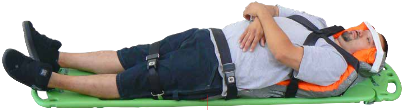
Full Spinal Splinting