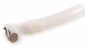
Adapter for FASPLINT Pump to MaxiValve