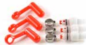
MaxiValve Replacement Kit