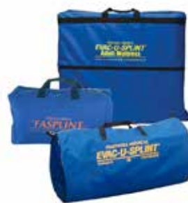
Replacement Carry Cases