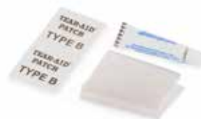
Repair Kit for Vacuum Splints and Mattresses