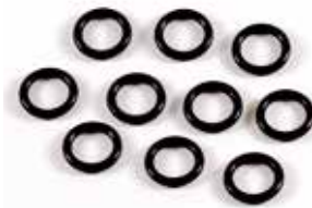
MaxiValve O-Ring Kit