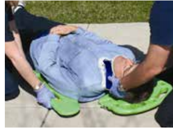
Functions Like A Scoop Stretcher