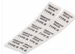
Patch Kit for Vacuum Splints and Mattresses