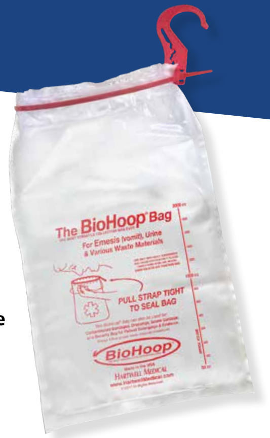
BioHoop with Hook Part Number BH 1100H BioHoop without Hook Part Number BH 1100