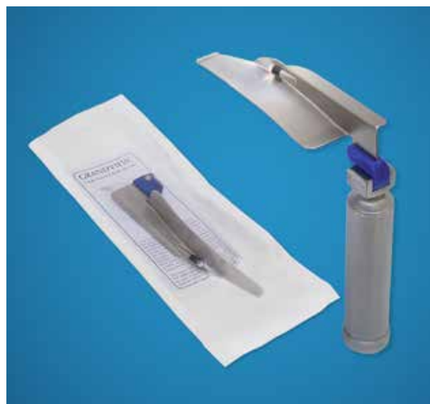
GV 2020A-DS Adult GRANDVIEW Disposable Blade Shown With BriteGrip Disposable Handle LB 1002-DS