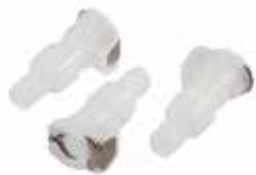
MaxiValve Female Coupling