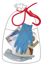
Dressings & Scene Garbage