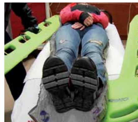
Safely extricate and transfer a patient to the cot. The CombiCarrierII is easily removed eliminating the loss of your valuable equipment.

The innovative design of the CombiCarrierII provides emergency medical and rescue personnel with two products in one, saving valuable storage space, weight and critical budget dollars. Comes with an industry leading 5-year warranty.