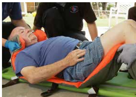
Ideal when transporting seniors, patients with kyphosis whose spine curvature does not allow them to lie flat, patients with hip fractures or those who are more comfortable with their knees flexed during transport.

The mattress is designed to alleviate pressure point pain and vastly increases patient comfort during transport on various patient handling devices like the CombiCarrierII® or a backboard. Polystyrene beads insulate the patient to help prevent hypothermia. The economical, tapered design accommodates your budget and your storage needs.