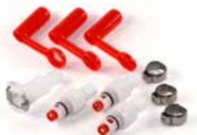
MaxiValve Retrofit Kit