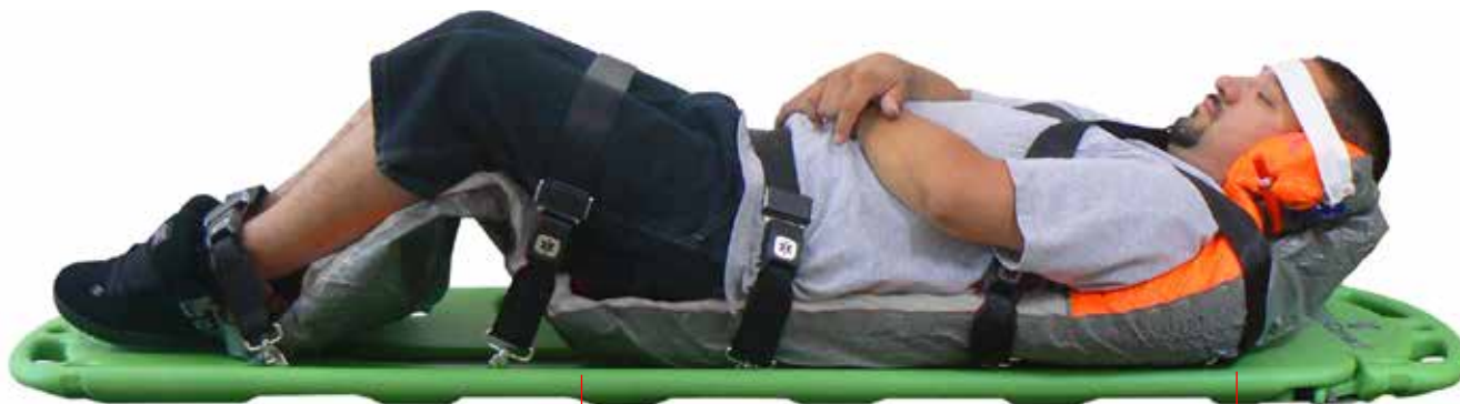
Full Spinal Splinting