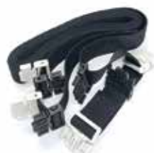
EVAC-U-SPLINT Adult Mattress Patient Restraint Strap