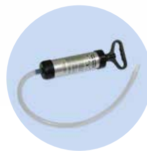
Economy pump included with FS-9000 RCPL kit.

For optional ordering configurations please see our website.