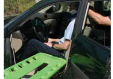
Tapered Ends To Simplify Extrication