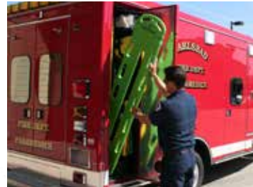
Fits In A Standard Backboard Compartment