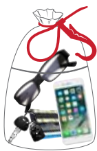
Patient Belongings & Evidence