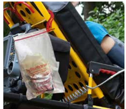
Easily and safely manage scene garbage or patient belongings quickly and efficiently.