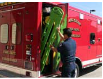
Fits In A Standard Backboard Compartment