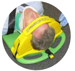
Optional Head Immobilizer Available Model CC 3400H