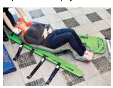
Can Be Easily Separated At Either End